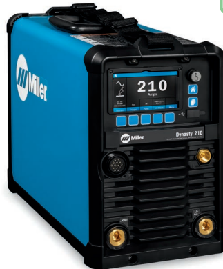
Dynasty 210 Machine only