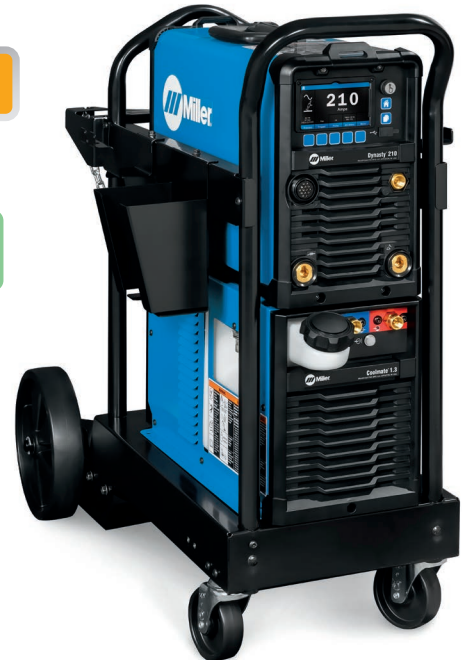
Dynasty 210 water cooled Tigrunner package

Program memory allows easy naming, saving and recalling of favorite weld settings.